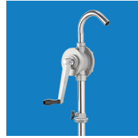
H-5647 Stainless Steel Rotary Drum Pump