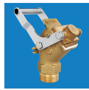
H-4935 Brass Gate Valve 2" Opening