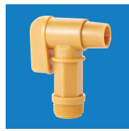
H-2955 Plastic Drum Faucet 3/4" Opening