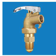
H-4934 Brass Drum Faucet 3/4" Opening