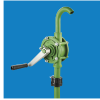
H-4377 Plastic Rotary Drum Pump