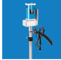
H-4933 Standard Electric Drum Pump