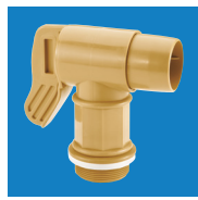
H-2956 Plastic Drum Faucet 2" Opening