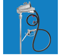
H-7193 Fuel Transfer Pump