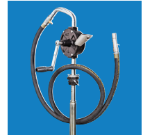
H-6502 FM Approved Rotary Drum Pump