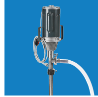
H-6501 High Viscosity Electric Drum Pump